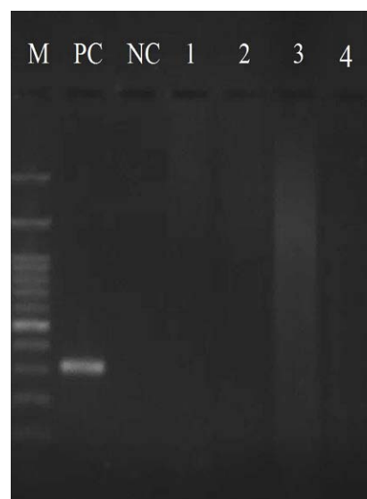
Figure 2. Electrophoretic analysis (1.5% agarose gel) of DNA amplified fragments for Mccp. M: DNA marker 100 bp (Sinaclon). PC: positive control; NC: negative control; Lanes 1-4: lung samples.

In conclusion, it seems that goats referring to Shiraz abattoir are free of Mccp and infected with M. haemolytica with the prevalence of 14%. As regards there is no epidemiological information on CCPP in our country, serological tests can be used to evaluate the overall distribution of the disease. In addition, sampling and molecular testing at the level of suspected herds to CCPP can be useful.